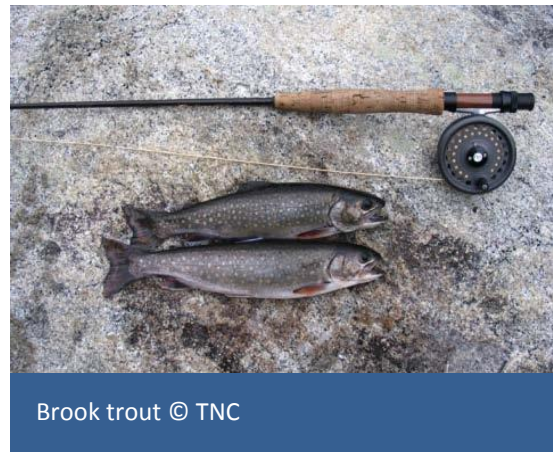
Brook trout

Freshwater. Aquatic habitats are at risk too. Once widespread, healthy populations of native eastern brook trout in Pennsylvania are now largely confined to small mountain watersheds. Nearly 80 percent of the state’s most intact brook trout watersheds could see at least some Marcellus gas and wind development during the next twenty years. Strongholds for brook trout are concentrated in north central Pennsylvania, where Marcellus development is projected to be relatively intensive in over half of the state’s best brook trout watersheds. Exceptional Value streams – the Department of Environmental Protection’s highest quality designation – could see hundreds of well pads (perhaps 300 -750) and dozens of wind turbines (perhaps 50 – 200) located within one-half mile under the projections. Because many intact brook trout and EV streams are in steep terrain, rigorous sediment controls, and possibly additional setback measures, are needed to help conserve these sensitive habitats.