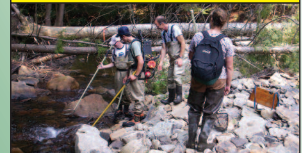
PA Fish & Boat Commission conducting a stream survey of Babb Creek

Please make check payable and send to: PEDF • PO Box 371 • Camp Hill, PA 17001-0371