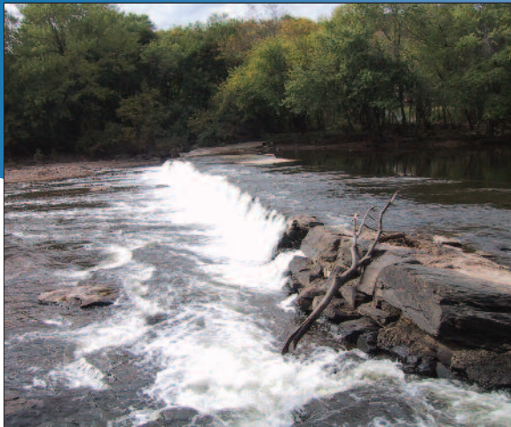
Indian Head at Perkiomen Creek

~ Article I, Section 27 Pennsylvania Constitution