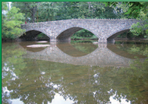
Garges Road Bridge over the East Branch of Perkiomen Creek